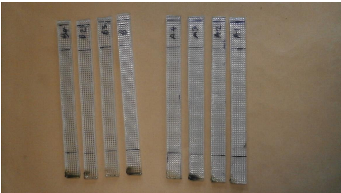
Figure 2. Product image